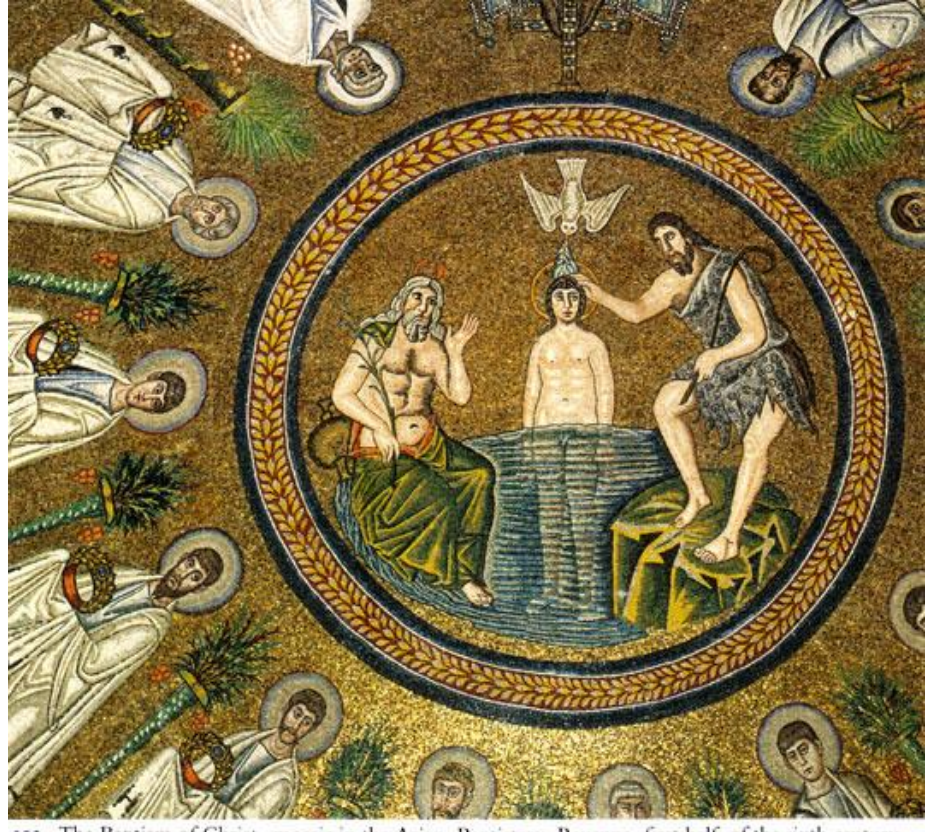
102. The Baptism of Christ, mosaic in the Arian Baptistery, Ravenna, first half of the sixth century

Surrounded by all the Martyrs and Saints