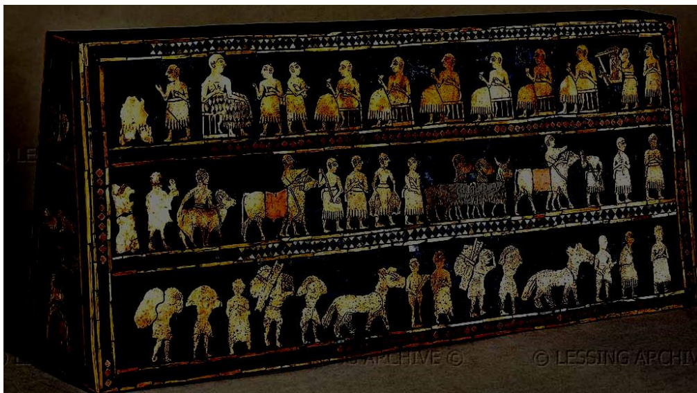
Here from the Penn University Museum is the